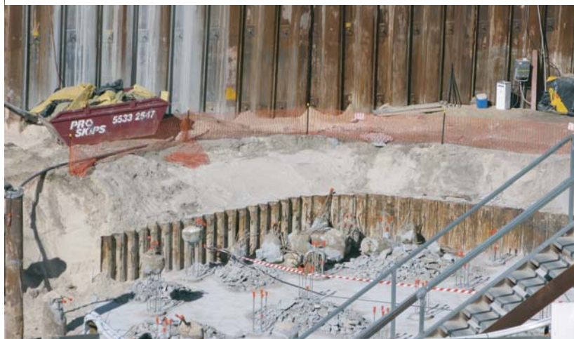
The foundations of Oracle Broadbeach (Tower Two) take shape

Acclaimed builders 'Grocon', now in their third generation, are building The Oracle for Niecon. Grollo's credits include landmarks Eureka, Casino Towers and Rialto Towers in Melbourne, Victoria.