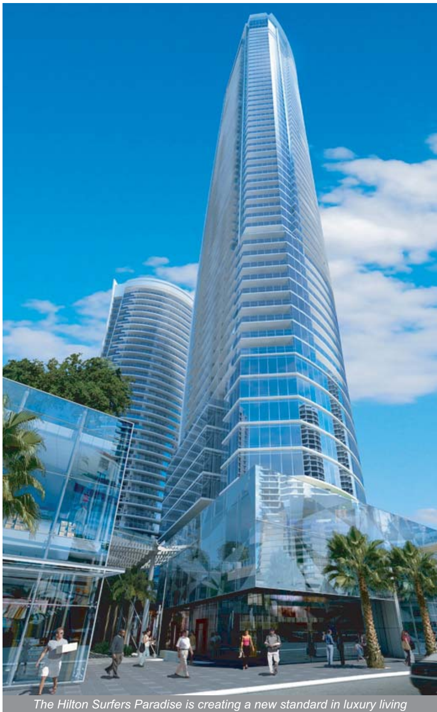
The Hilton Surfers Paradise is creating a new standard in luxury living

The residences at Hilton Surfers Paradise Hotel & Residences, Gold Coast, Australia are not owned, developed or sold by Hilton International Manage LLC or its affiliates. Dolphin Management Pty Limited ACN 117 546 479 uses certain "Hilton" trademarks under a license from Hilton International Manage LLC to Dolphin Management Pty Limited ACN 117 546 479