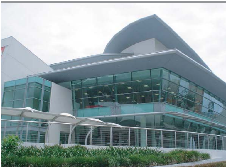
The Gold Coast Convention and Exhibition Centre